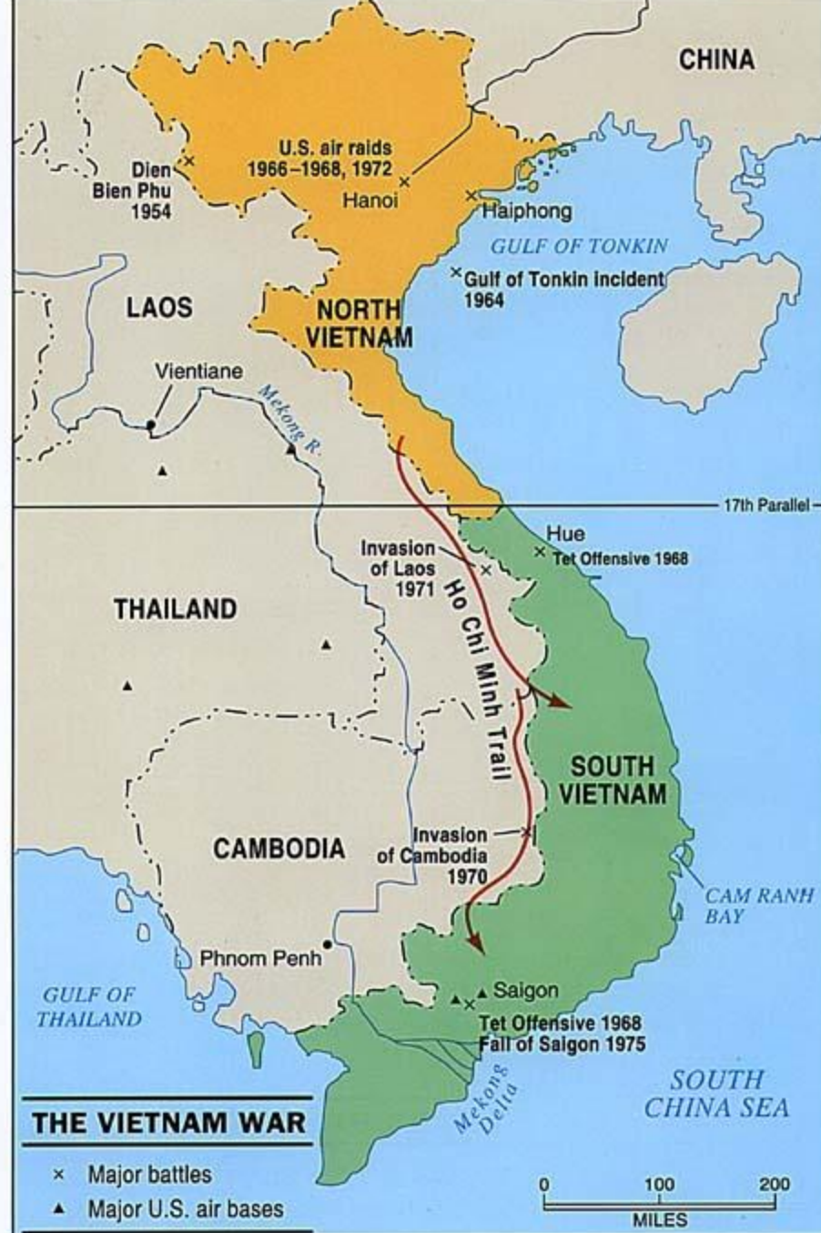
The Vietnam War

- Trail from North Vietnam through Laos and Cambodia used to resupply the Vietcong.