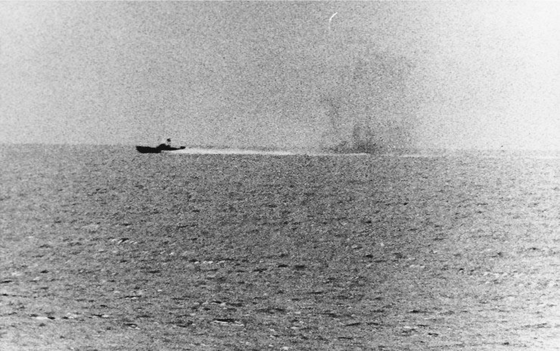
Photo # USN 711524 North Vietnamese motor torpedo boat attacking USS Maddox, 2 Aug. 1964